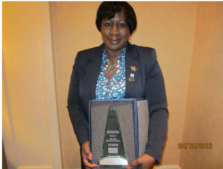
Pictures of GVENA members at Setting the Pace April 19 th thru 21 st 2012

New York State Council Receives National Award Each year the National organization of ENA recognizes state councils who implement a diverse strategic plan. For 2011, New York State demonstrated many of the criteria used to bestow this honor.